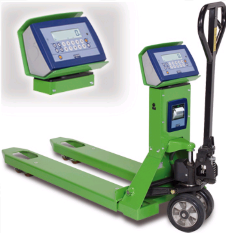
TPW with optional printer