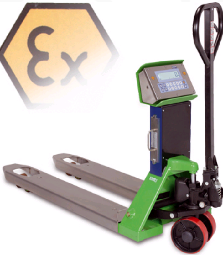
TPWX with optional STAINLESS STEEL forks.