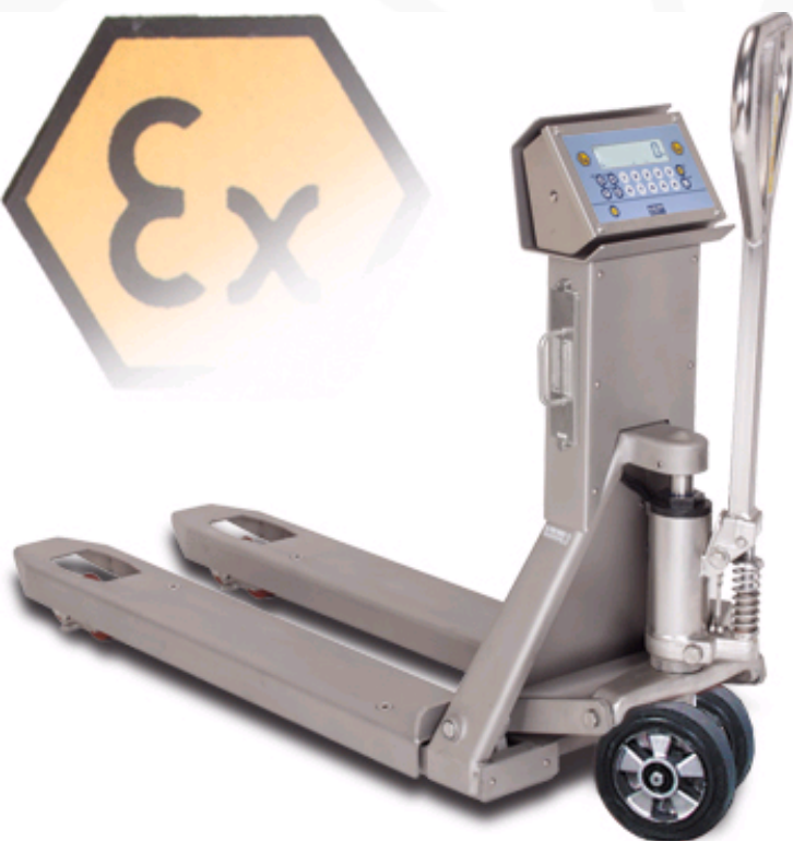
TPWX2GDI: pallet truck scale in STAINLESS steel, for hazardous areas.