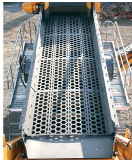
Top deck punchplate option.