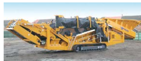
Conveyors folded and feed hopper retracted ready for transport.

Parker Plant Limited, Viaduct Works, Canon Street, Leicester, LE4 6GH, United Kingdom